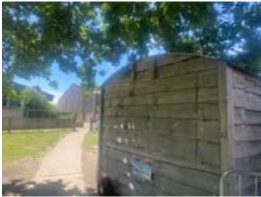
Indoor Playbarn Pantry